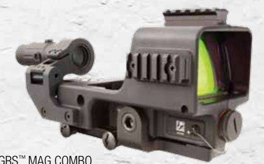
MGRS™ MAG COMBO